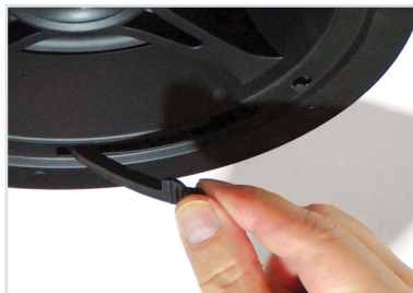
Unique, patented clamp system allows for easy installation and removal.