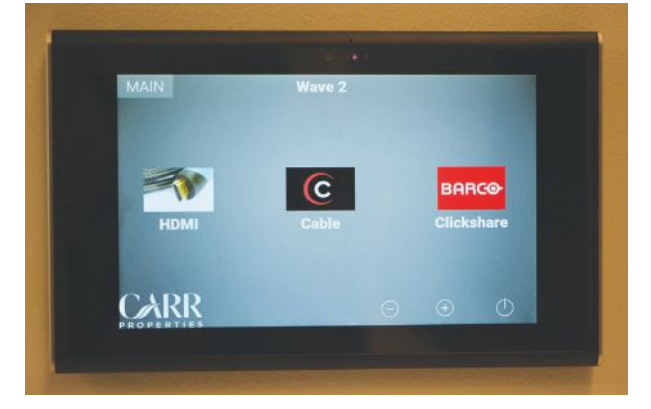
URC gear, says Nard's, has built-in flexibility and a foundational tech protocol that doesn't overcomplicate the user experience – which, in this case, spells tenant retention.

we're able to put in custom-branded control to fit the environment into places people would never have thought affordable before. URC gets the job done, and brings a lot of value to the building.